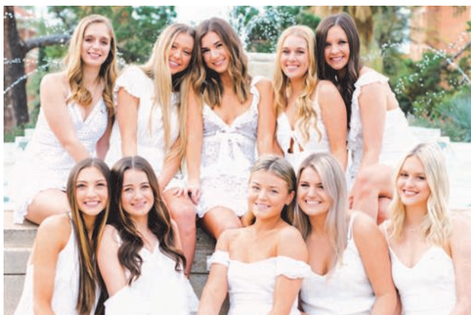
2019 Executive Council

In the life of a chapter, the approach of the holiday season signals a change in chapter leadership. At this time, we'd like to congratulate and thank the 2019 Executive Council on a successful year. We are grateful for their leadership. They did a great job of managing member concerns and expectations as the chapter dealt with the challenges of living through a construction project.